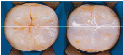
Before sealant is applied.

Research shows that sealants can last for many years if properly cared for. Therefore, your child will be protected throughout the most cavity-prone years. If your child has good oral hygiene and avoids biting hard objects, sealants will last longer. Your pediatric dentist will check the sealants during routine dental visits and recommend re-application or repair when necessary.